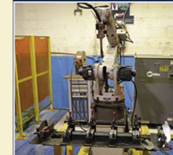
Robot Mig Welding