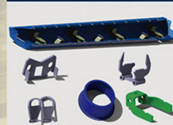
Product Designed in Catia