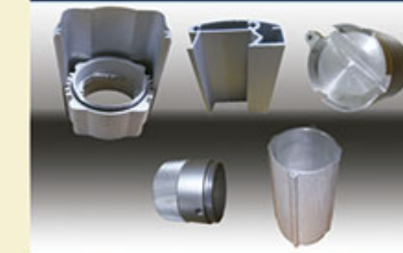
Extrusions with Machining