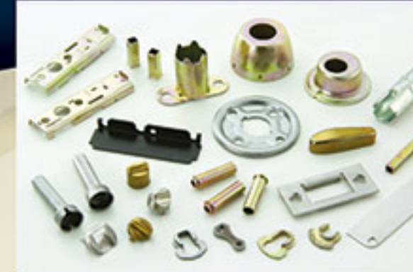
Precision Metal Stamping